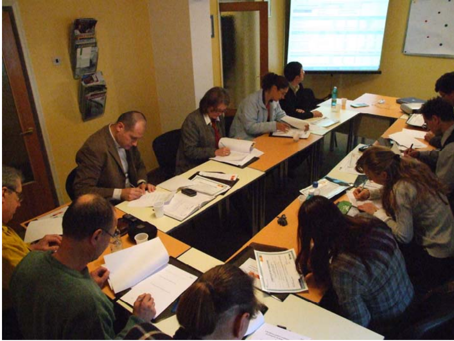
Figure 3 Coursants completing the Questionnaire