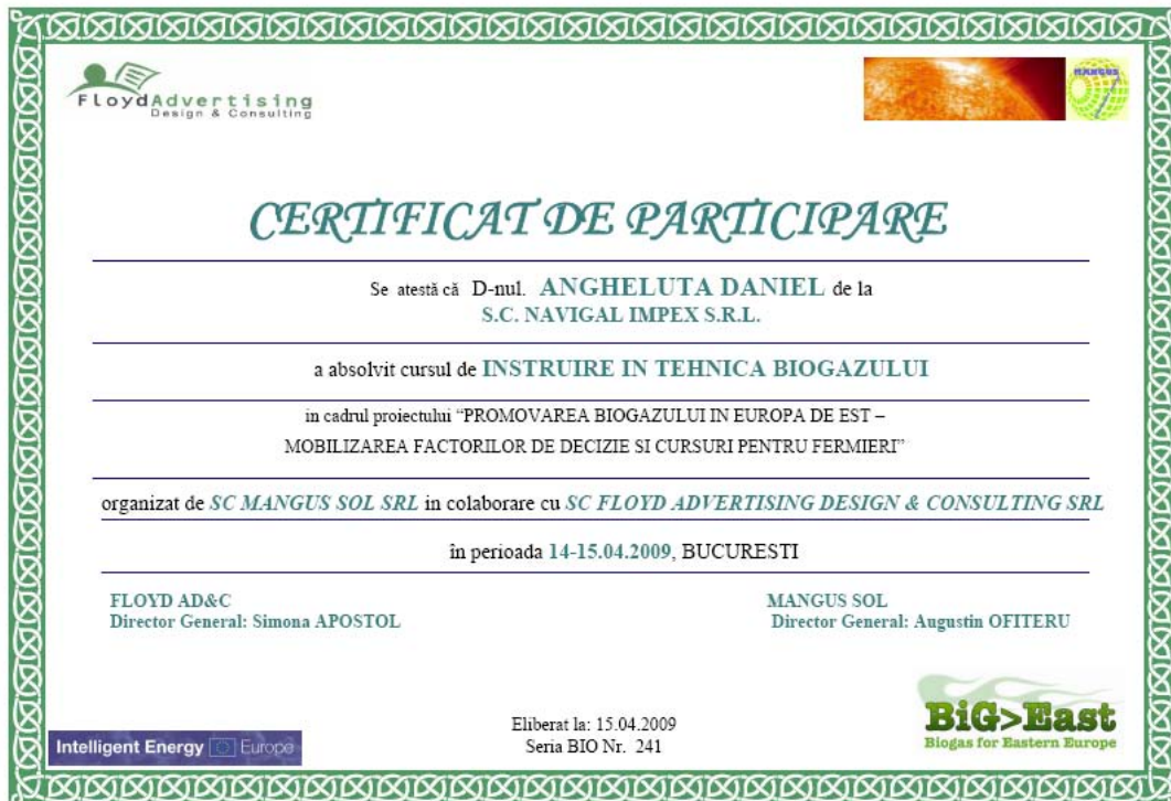
Figure 4 Dimploma model