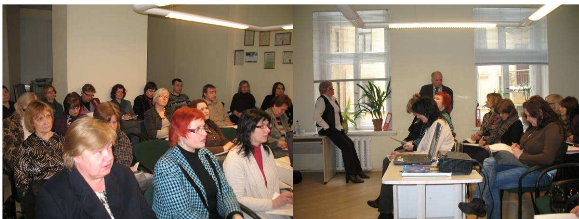
Participants of the 2 nd Mobilization Campaign

The main discussion was about the role of biogas technologies in Latvia and how to switch the focus from biogas production as a business project to biogas production as a waste management technology. Discussion participants concluded that extremely high feed-in tariff for biogas electricity has led to the number of low quality biogas plant projects in Latvia designed for producing as much as possible electricity and losing the initial biogas technology sustainability idea.