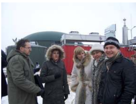
Figure 2: Visit of the 1 st Latvian agricultural biogas plant in Vecauce (February 2009)