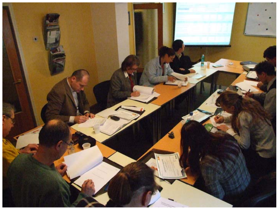
Figure 3 Coursants completing the Questionaire