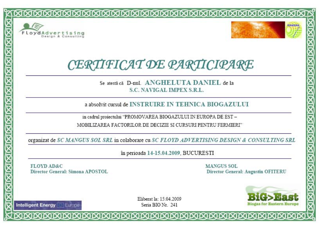
Figure 4 Dimploma model