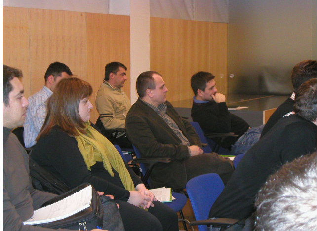
Figure 25 participants at 3rd training