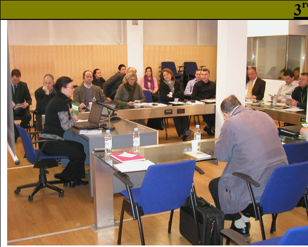
Figure 23 participants at 3rd training