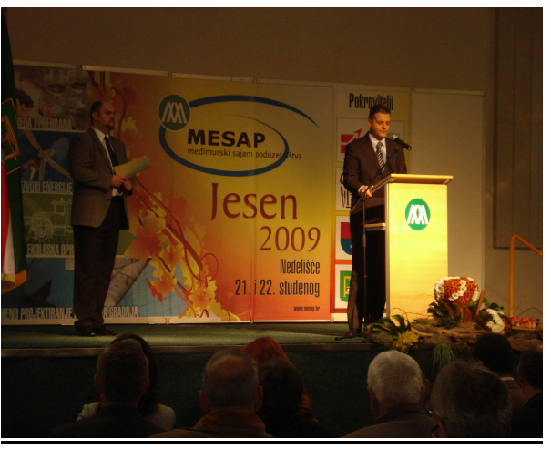
Figure 4 Branimir Horaček, head of energy sector, Ministry of Economy, Labour and Entrepreneurship, Croatia