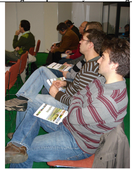
Figure 19Future biogas plant operators