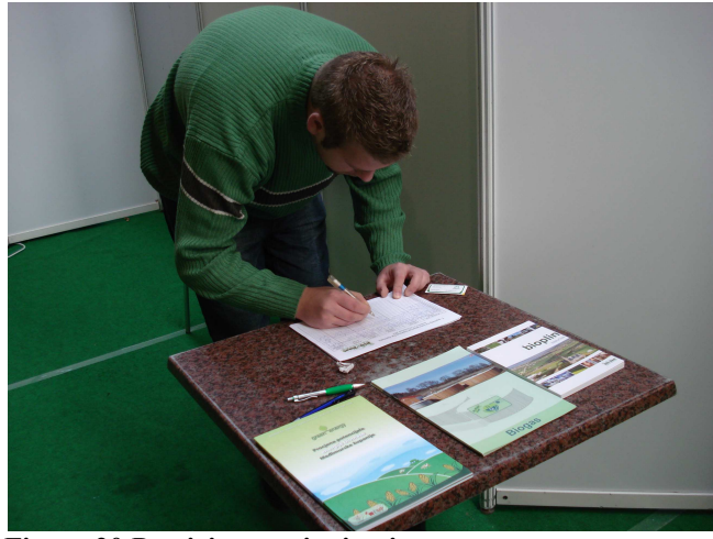
Figure 20 Participants signing in