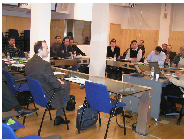
Figure 28 participants at 3rd training-day2