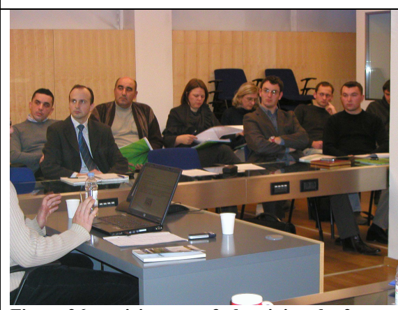
Figure 26 participants at 3rd training-day2