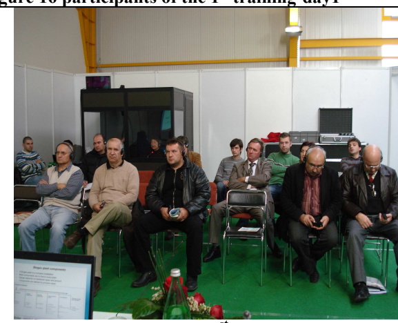
Figure 18 participants of the 1st training-day2