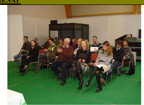
Figure 16 participants of the 1st training-day1