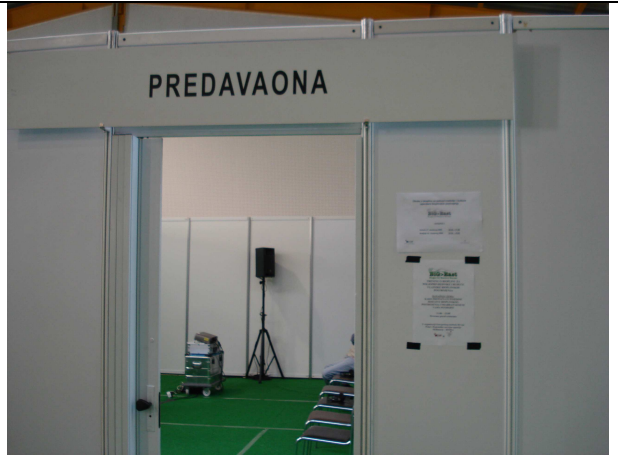
Figure 17 training room provided by MESAP organiser